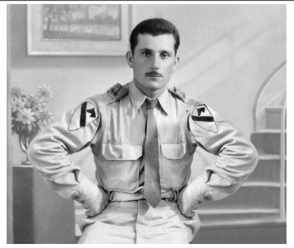
Does anyone recognise this Soldier? ..... The answer is on page 4